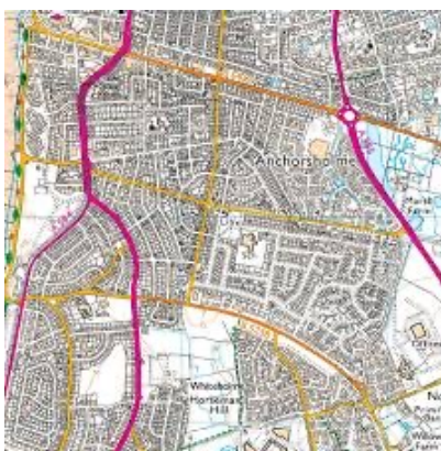
Ordnance Survey map of Lancaster.