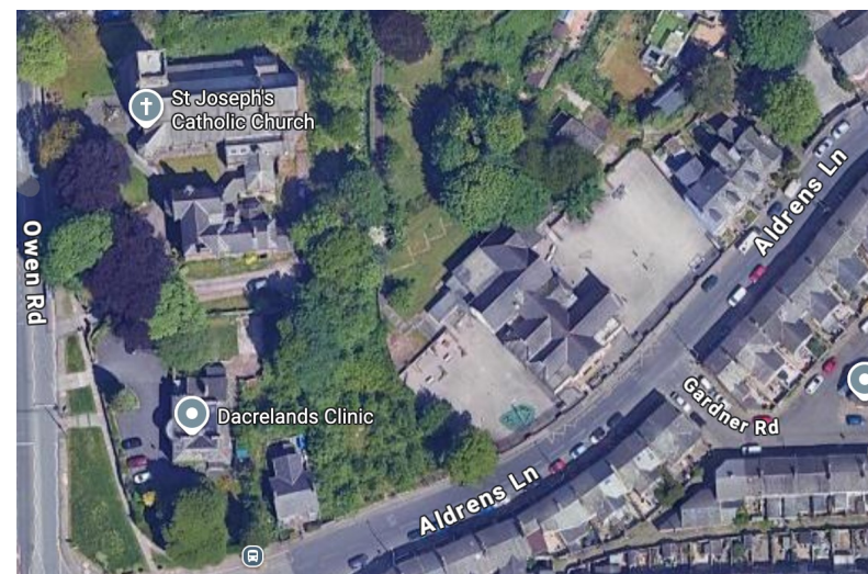
Aerial view of the school.

Ordnance Survey – the UK's national mapping agency, creating accurate maps of Great Britain